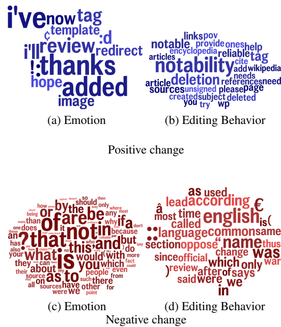
Figure 3: Unigrams visualized in terms of their Pearson correlations with (a) positive emotional change ( .01 < r < .05 ) and (b) editorial change ( .03 < r < .05 ), and (c) negative emotional change ( -.05 < r < -.03 ) and (d) editorial change ( -.04 < r < -.02 ) after Benjamini-Hochberg p-correction ( p < 10e-15 ). The size of the word denotes the magnitude of the correlation while the shade indicates its frequency.